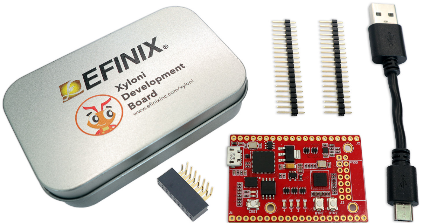
Figure 2 Xyloni Development Kit